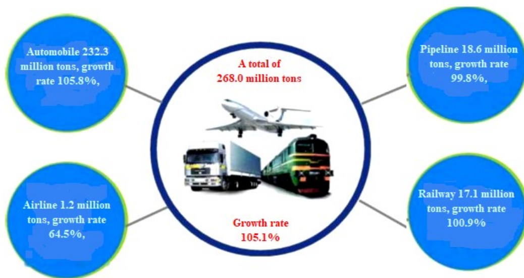
Figure 1. Cargo status by all types of transport

Currently, Uzbekistan has a huge transport potential and unique opportunities to meet the needs of the country in all directions and all types of transport.