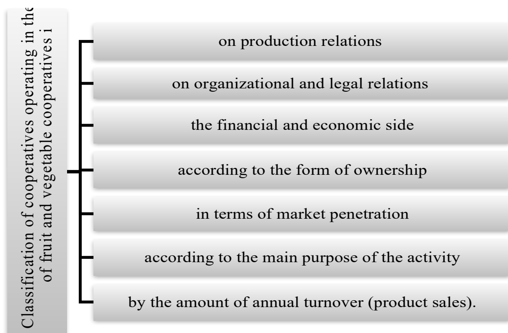
Figure 1.3 Classification of cooperatives operating in the field of fruit and vegetable cooperatives 5

The joining of fruit and vegetable producers into cooperatives is economically attractive due to absolute and relative reduction of transport costs related to the delivery of products to consumers , as well as reduction of gross costs at the macro level. is considered