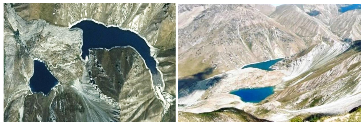
Figure 1. Space image of the Ikhnach lake system and photo taken by the authors

Lake Upper Ikhnach (Big Ikhnach) is located at an absolute altitude of 2402 m. The length of the lake is 1.2 km, the width is 145-400 m, the depth is about 14.5 m, some places are 46.5 m, the area is 0.19 km<sup>2</sup>. Upper Ikhnach lake is considered a moraine lake due to its formation.