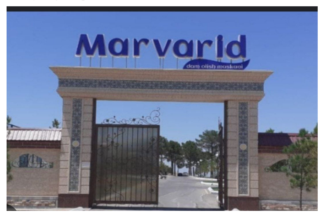
Figure 1. Entrance to the Termez Marvaridi Sanatorium.

Main part. Termez Marvaridi Sanatorium. Republican Specialized Therapy and Medical Rehabilitation Scientific and Practical Medical Center. Located near the "Uchqizil Reservoir" in the "Uchqizil" neighborhood of Termez district, Surkhandarya region. (picture-1)